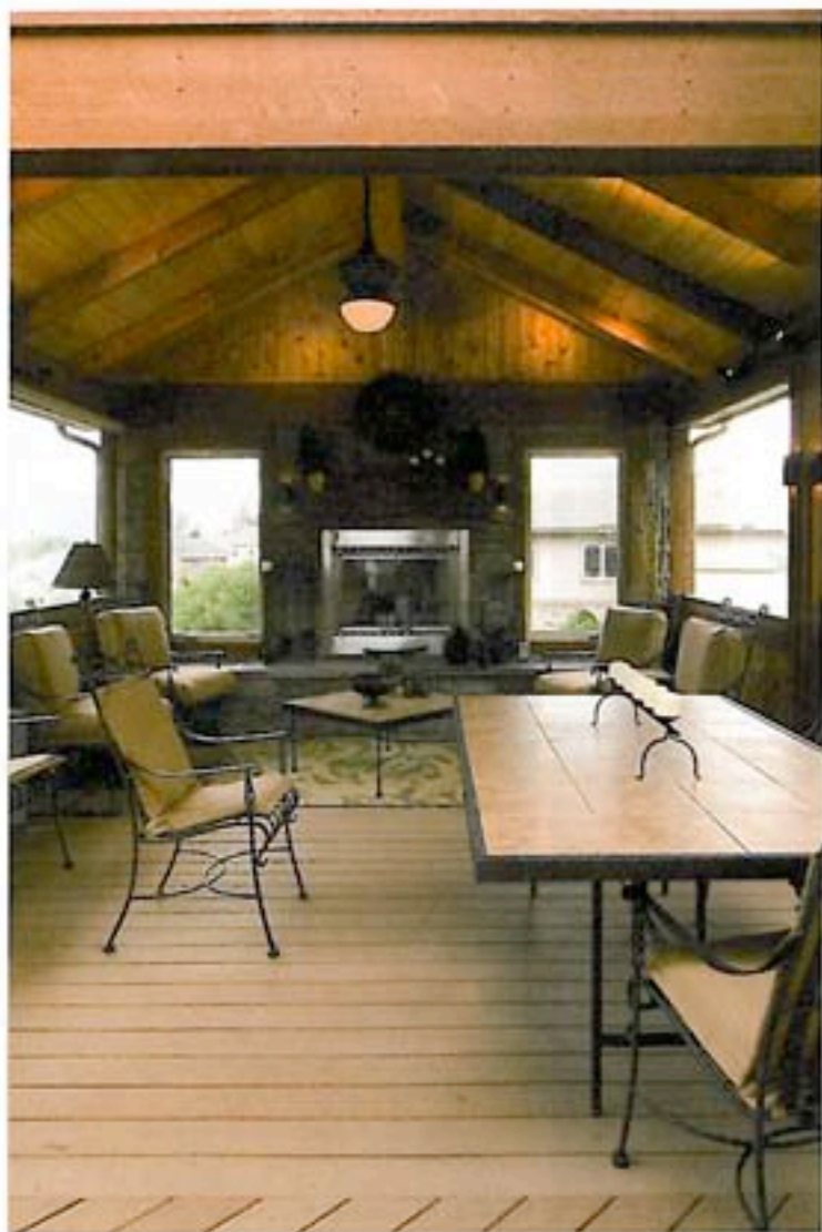
ABOVE: Surrounded by windows, this all-season room from Colorado Creations can be enjoyed year-round.